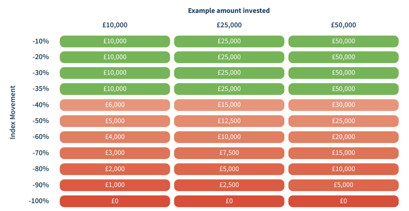
Return of invested money based on the performance of the Index from the Start Date to the End Date

The table below gives examples of how much invested money would be returned based on a range of scenarios and invested amounts. The table does not give predictions of what we believe you might receive. It is only designed to illustrate the calculation.