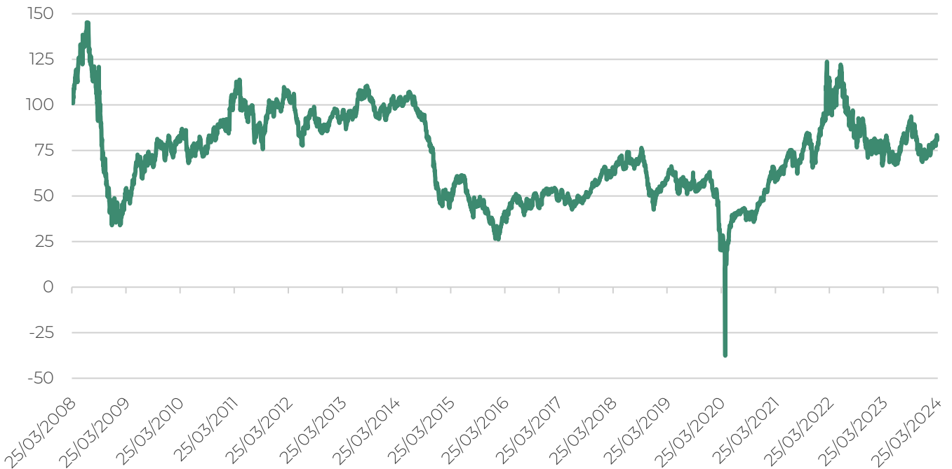
WTI Crude Oil

Important Information: The chart above represents the historic performance of the Underlying Commodity and should not be relied upon as an indication of future performance.