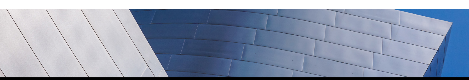
Walker Crips | UK 90% Annual Kick-out Plan | (MS167) 13

In order to withdraw all or part of your investment, we will need to sell the underlying securities of the Plan (or a proportion thereof) which are held by us on your behalf. The amount you will receive back will be determined by the Issuer. During the Investment Term the value of your investment may go up or down. Different factors, such as a fall in the level of the Index, or a rise in interest rates, can have a significant negative impact on the value during the lifetime of the Plan.